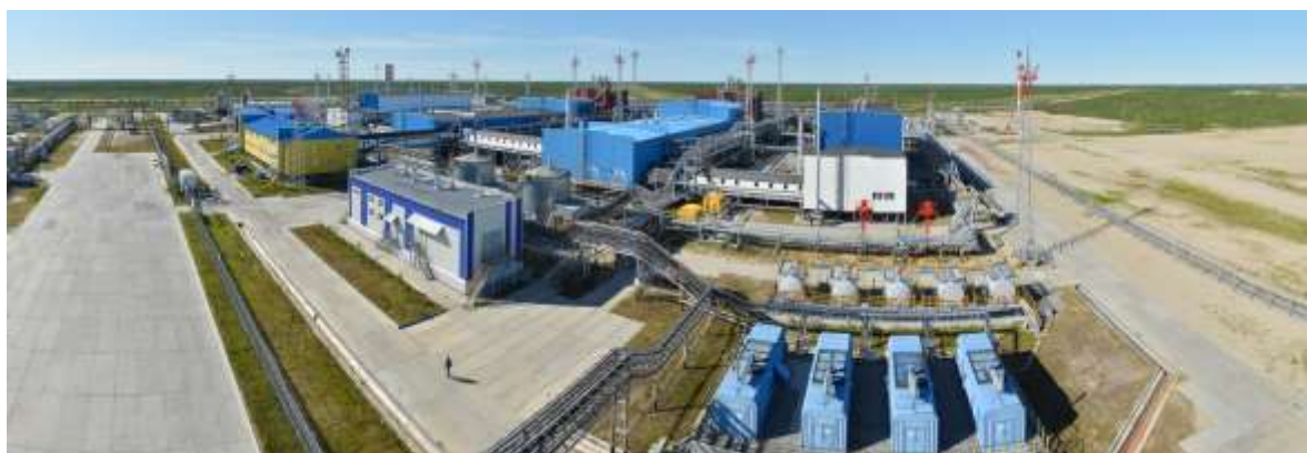
Fig. 3. Overview of the Comprehensive Gas Treatment Unit.

The averaged samples from the top layer (0-6 cm) of disturbed tundra soil (aggregate-size distribution – cohesive sand with 5-10% clay content) nearby the Comprehensive Gas Treatment Units were taken for research (Fig. 3). One section of the soil was free of vegetation the other one had fragments of restored vegetation such as grass and herbage cultures and mosses. The soil free of vegetation contained 0.2% of C_{org} and the soil with vegetation cover – 0.9% of C_{org} . Recultivation tests involved application of 54% ash content peat to the soil in the ratio 1:4. Organogenic top (0-10 cm) of typical tundra peaty-gleezem soil of 39% ash content was used as a standard. Physicochemical properties of soil and peat test samples are listed in Table 1.