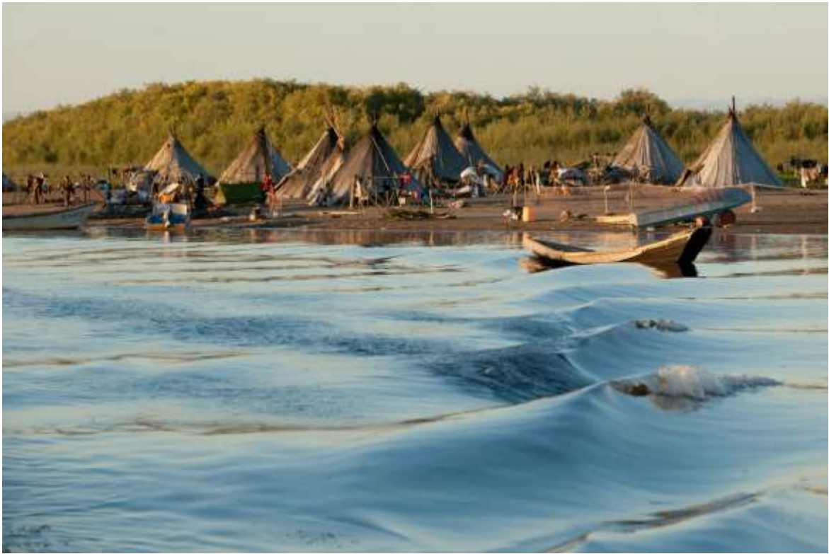
Fig. 1. Coastal tundra area by the Taz Bay.