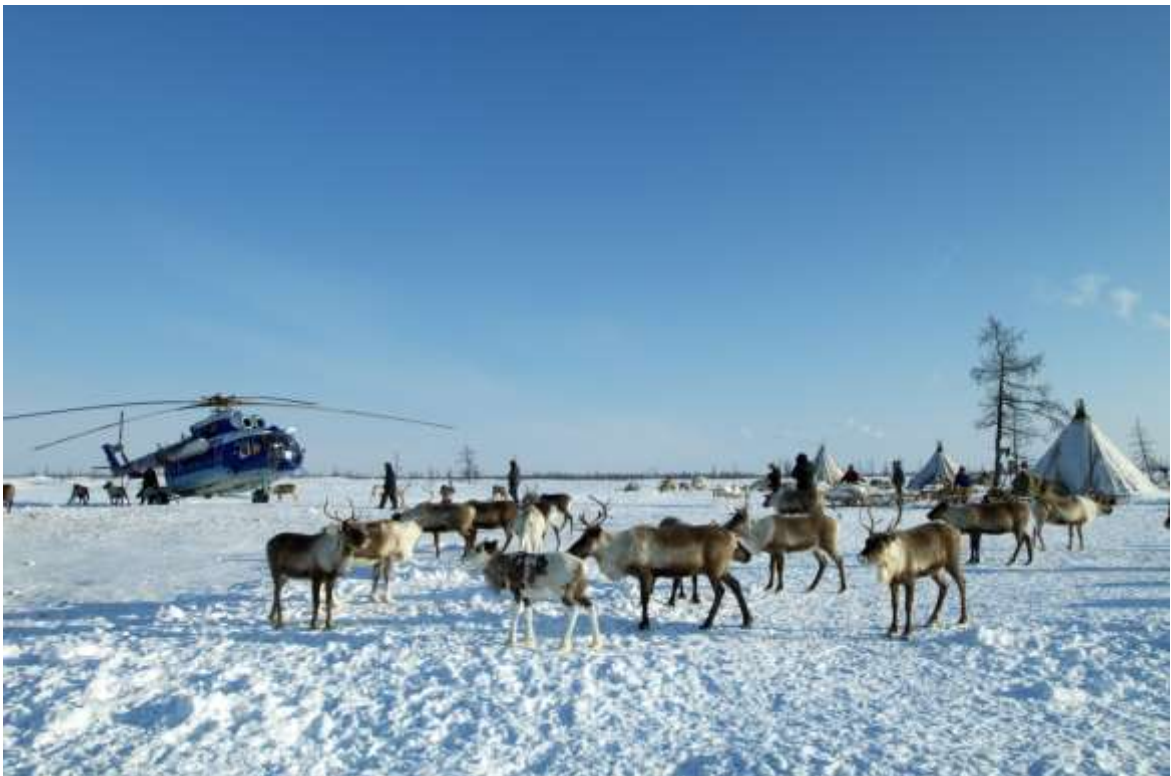
Fig. 2. Reindeer herder's camp.