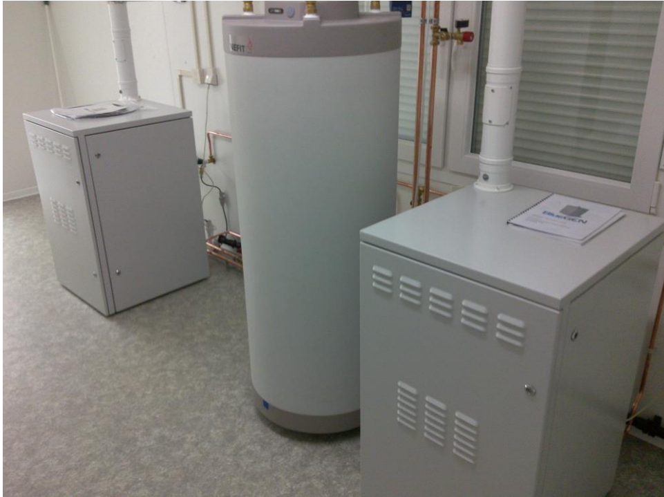
Figure 2. Set-up of two CFCL BlueGen fuel cells at EnTranCe

Currently, the project does only involve the balancing of electricity demand. For households in the Netherlands, energy demand for heat demand typically is some five times higher than electricity demand. Thus, looking at the electricity balance clearly is only part of the story. Therefore, in the longer run the aim is to have the fuel cells also supply the heat according to some simulated demand, or preferably the measured demand from the same village as is used for the electricity demand. However, as the fuel cells provide insufficient heat to meet this demand, we will also involve micro-CHP. The micro-CHP is primarily controlled in such a way that heat demand is satisfied, while it of course at the same time produces electricity. Thus, the inclusion of the micro-CHP adds another boundary condition to the operation of the fuel cells.