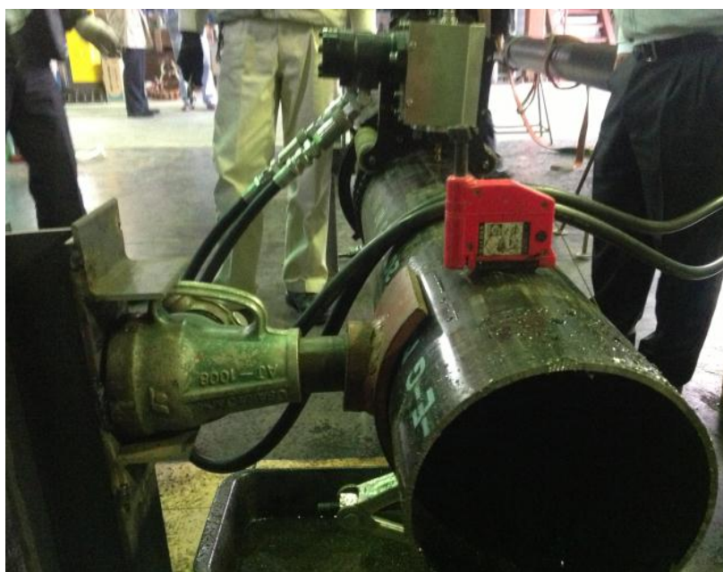
Figure-3 Cutting the bended steel pipe