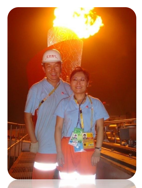
Professor Gao Chunmei, from Beijing Gas Research Institute designing torch for the 2008 Beijing Olympic Games