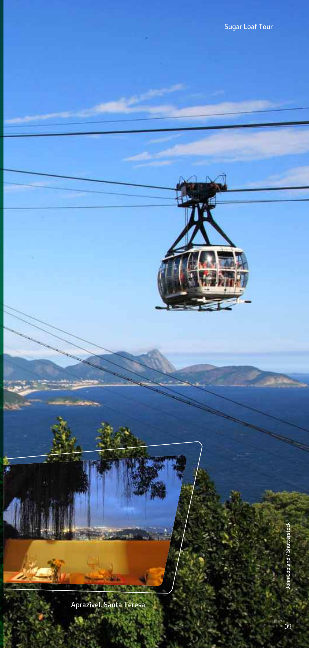
Aprazível, Santa Teresa