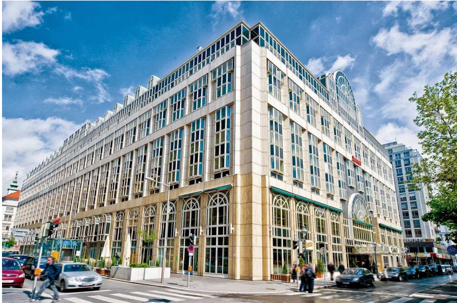
Vienna Marriott Hotel, Parkring 12A, 1010 Vienna Phone: 0043 1 515180