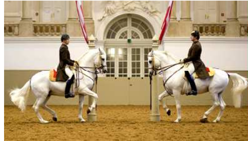
Spanische Hofreitschule Spanish Riding School

St. Stephen's Cathedral was severely damaged by fire in the last days of the Second World War and virtually reduced to rubble. But with seemingly everyone lending a hand, the cathedral was rebuilt in just seven years: the emblem of Austria and symbol of Austrian identity had risen once more from the ashes. You can climb up St. Stephen's Cathedral (South Tower, Türmer Stube), take the lift up to the Pummerin (North Tower), or go down into the catacombs.