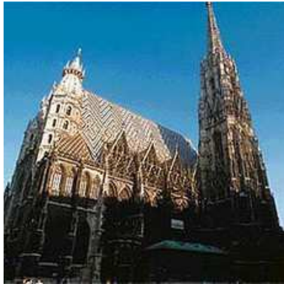
Wiener Stephansdom St. Stephen's Cathedral

St. Stephen's Cathedral was severely damaged by fire in the last days of the Second World War and virtually reduced to rubble. But with seemingly everyone lending a hand, the cathedral was rebuilt in just seven years: the emblem of Austria and symbol of Austrian identity had risen once more from the ashes. You can climb up St. Stephen's Cathedral (South Tower, Türmer Stube), take the lift up to the Pummerin (North Tower), or go down into the catacombs.